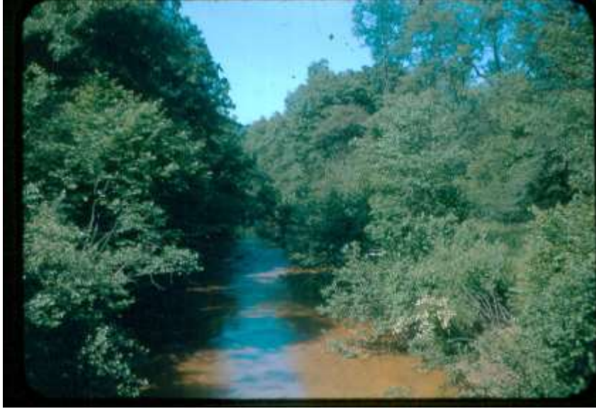
Swimming Hole near Farm