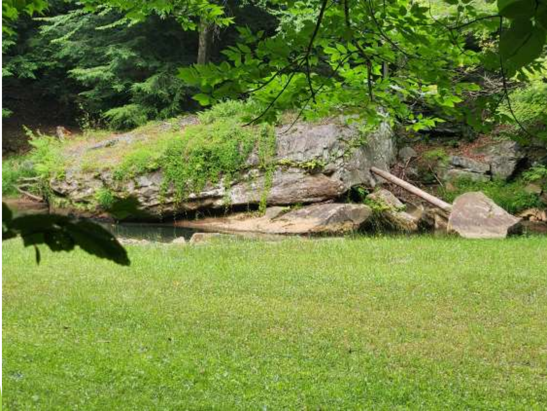
Old Swimming Hole

Now: Old swimming hole, but it was posted, took pictures from afar. Interesting yard art - Elmer wishes they had tractors like these in the old days.