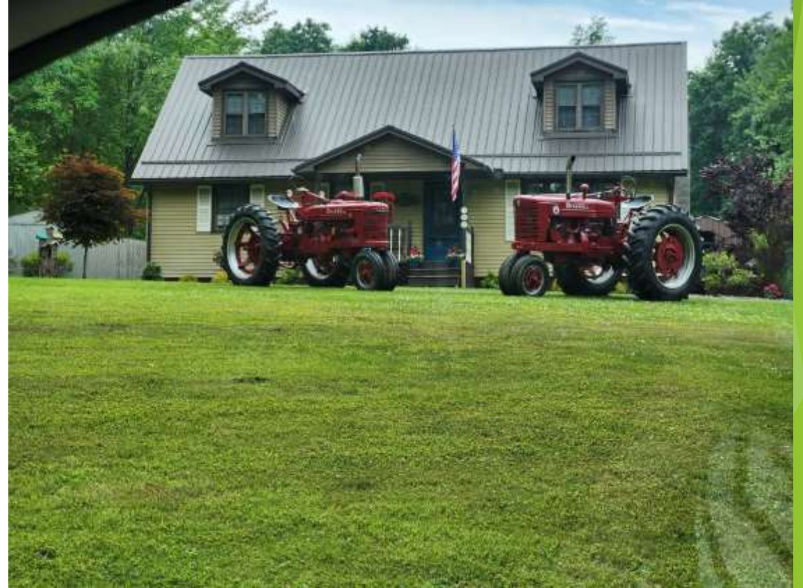
Tractor Yard Art