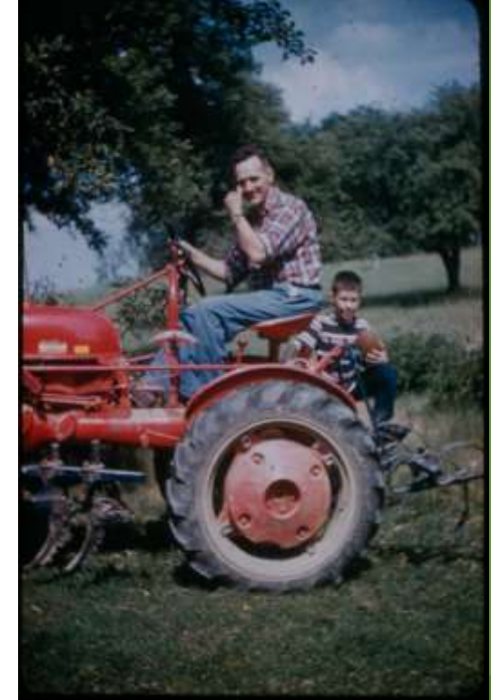
EWB Sr on Tractor