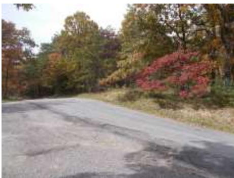
Fall in Southwest Virginia—pictures don't do it justice. So beautiful this year.