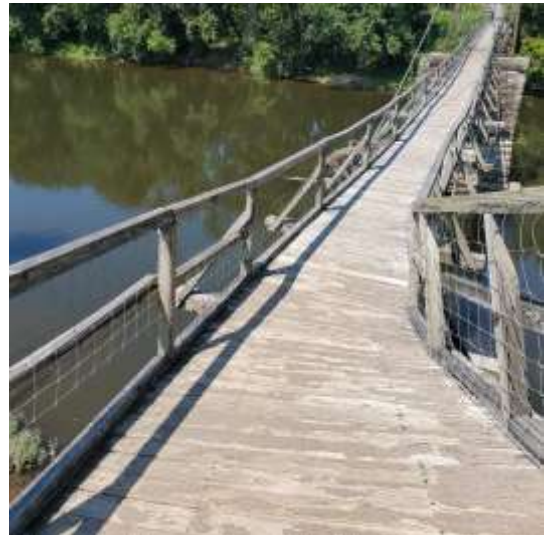
Bridge across the James River in Botetourt originally built by our great grandfathers after the CW