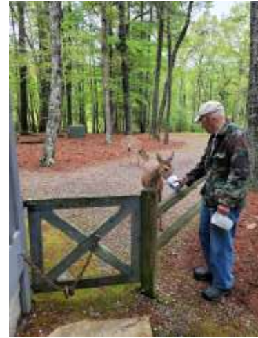
Our one deer that will eat out of a cup is still there.