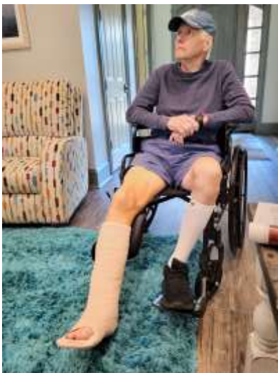
Surgery # 2—removed cage, set the broken bones and put on splint.