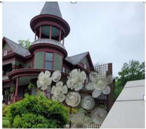
Wonder what to do with old cut glass? Try a bouquet!