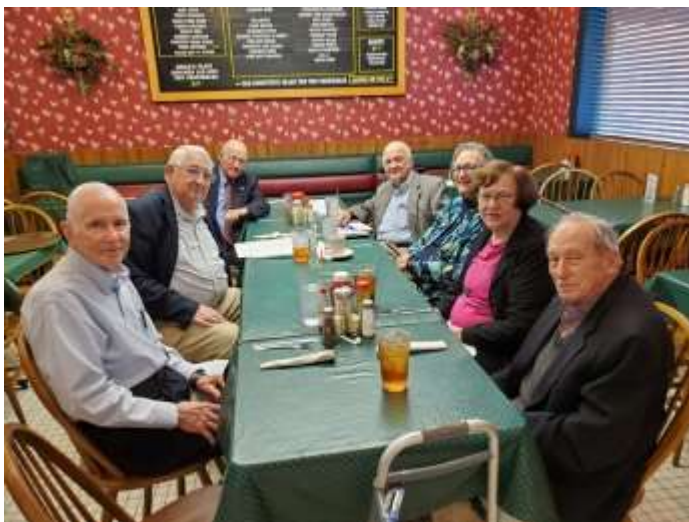
USC NROTC Class of 1960