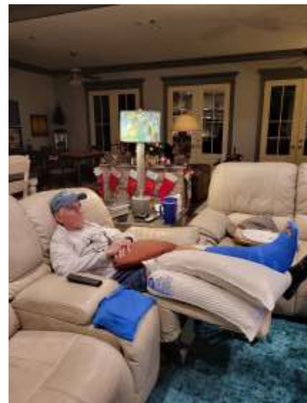
Current Status—maybe a boot splint tomorrow