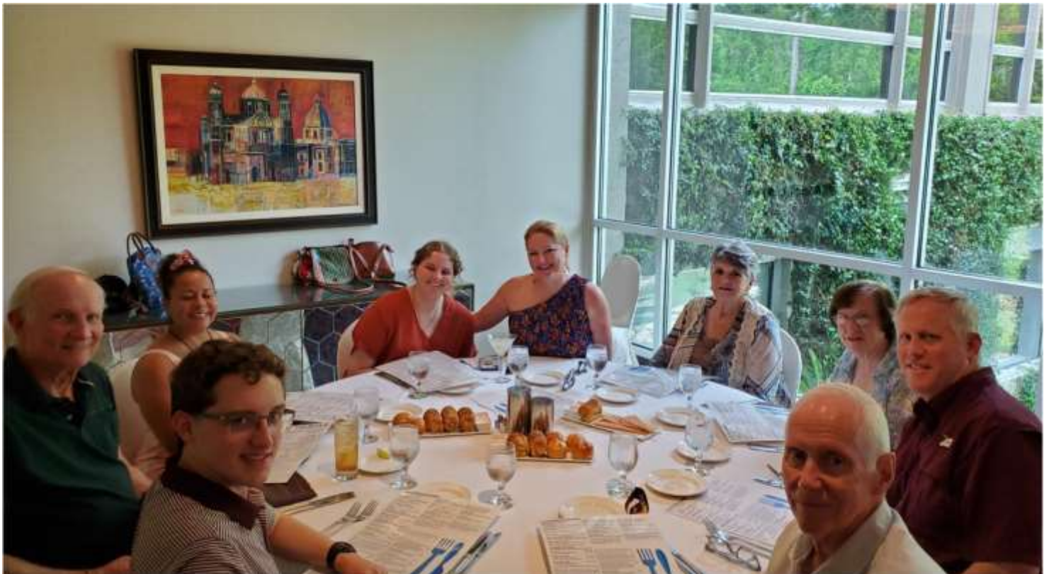
Pre-Graduation Luncheon with Grandparents Houston Racquet Club June 11, 2022