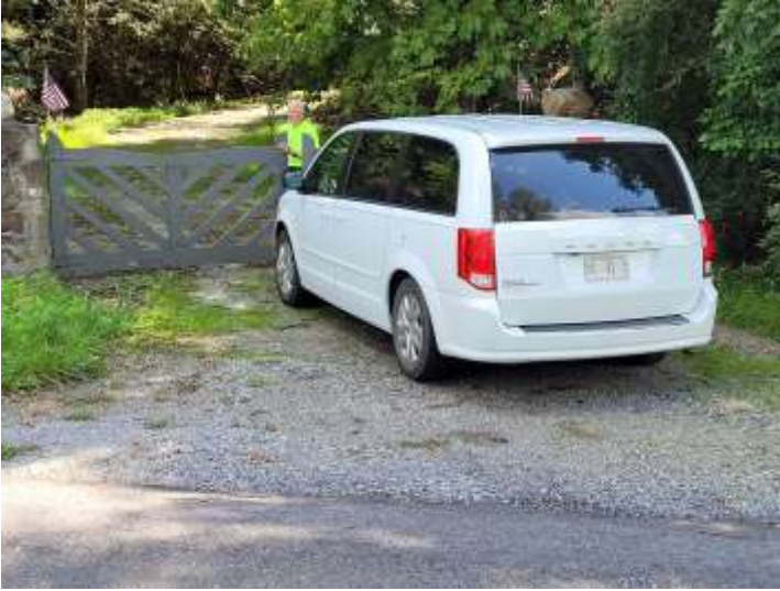
We arrived at the gate in Little Creek in May.