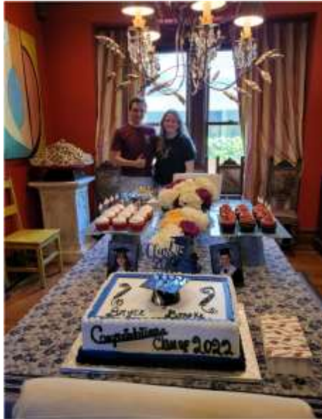
Graduation Party Pumpkin House June 10, 2022