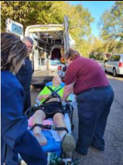
The Accident—Pit Bulls and Bicycles don't mix!