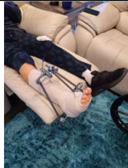
Surgery # 1 put a cage around ankle—screwed in 5 places—Very painfull