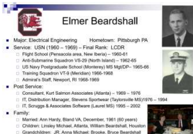
Elmer's Page in the Reunion Book