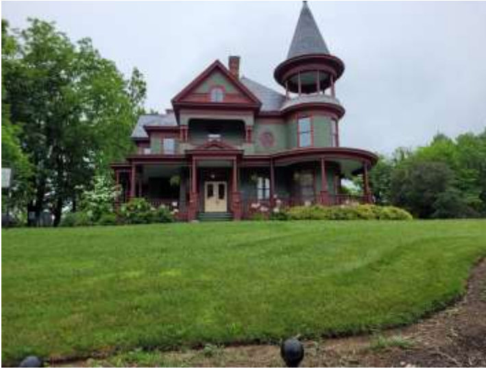
Alexander Black (Queen Anne House) in Blacksburg