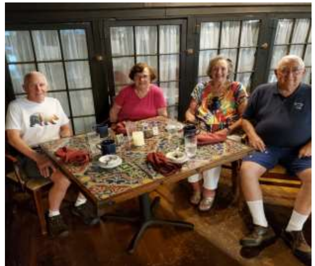
We stopped in Cherokee NC to visit the Queens enroute to VA