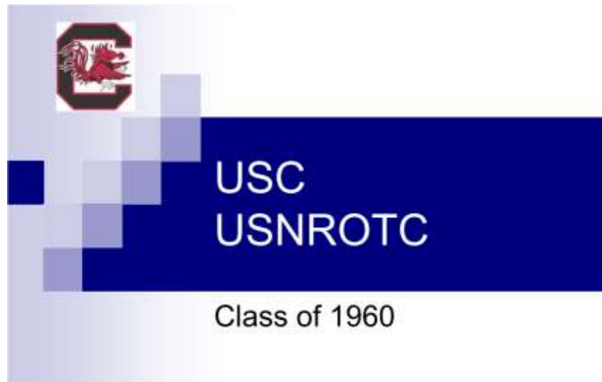
60th (really the 62nd reunion) Reunion Book